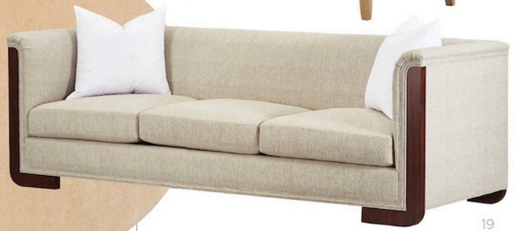
1. Assembly 02 by Rodrigo Martin , Gallery 212 / 2. Kane chair, Bradington-Young / 3. Rosinda armchair, Norwalk Furniture 4. Apex throw, Johanna Howard Home / 5. Hexagon martini table, Miranda Kerr Home , Universal Furniture / 6. Sorrell three-drawer chest, Hooker Furniture / 7. Reverie collection, Kalaty Rug / 8. Holt coffee table, Made Goods / 9. Galapagos sofa, Adriana Hoyos Furnishings